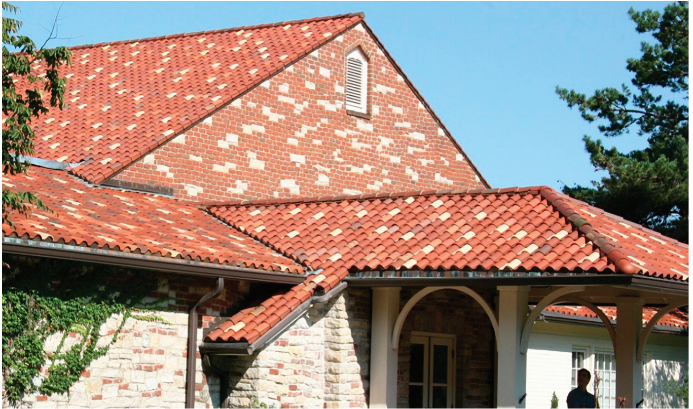
Shown in a multiple color blend