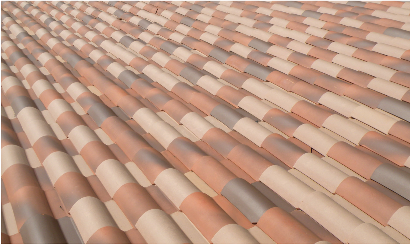
Shown in a multiple color blend