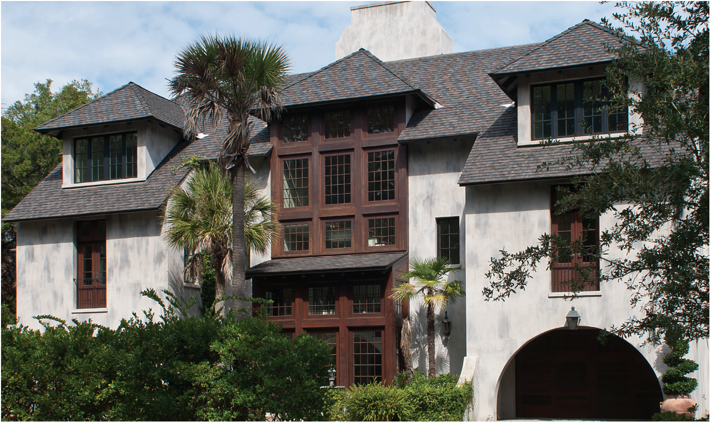
Shown with Norman Sand